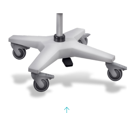
Hydraulic pedal for easy height adjustment and 4 braked wheels for safety.