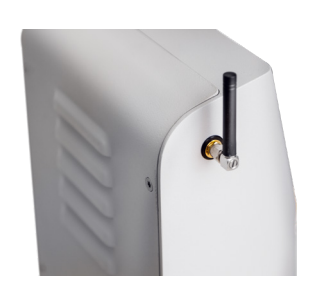
Adapter for wireless connection at 866/915 MHz.